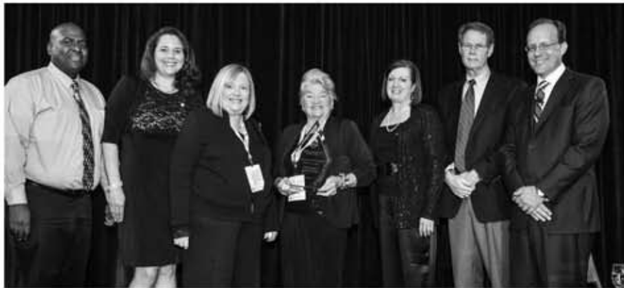
L'Hermitage I team cleans up at awards gala.