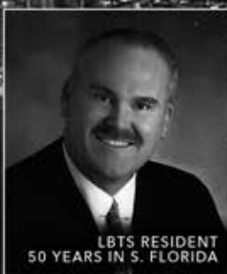
LBTS RESIDENT 50 YEARS IN S. FLORIDA